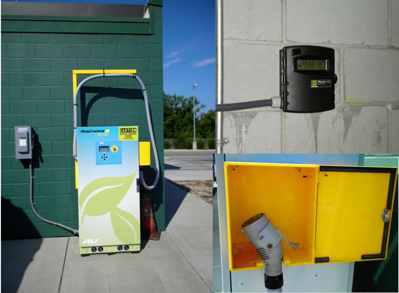
Figure 4-3 AeroVironment EV30-FS Charger Installed at CMRTA (left), Close-up View of Electric Meter (top right), and Charger Connection (bottom right)